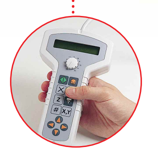
Remote control for various engraving functions